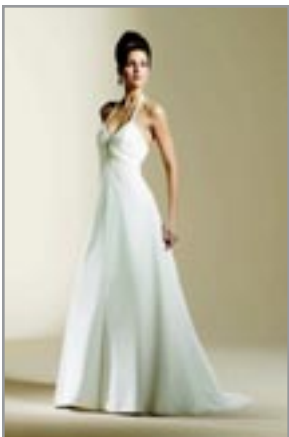
Mori Lee Halter Sweetheart

For instance, the long, tapered A-line strapless gown is still the leading fashion silhouette but the addition of a 'sweetheart'-shaped bodice with bands of color gives it a unique touch. For brides who prefer a non-strapless look, the halter neckline with the sweetheart shape is a fresh and individual approach.