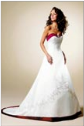
Mori Lee Strapless Sweetheart

Of the twenty-two thousand dollars spent on the wedding, it was surprising to learn that, on average, only eight hundred dollars is spent on the wedding dress. According to a senior executive at David's Bridal, more and more brides are choosing to spend less on their wedding gowns. Instead of paying several thousand dollars for gowns that require multiple fittings, today's brides prefer to buy "off the rack" in their size and then spend their savings on the wedding reception or the destination wedding.